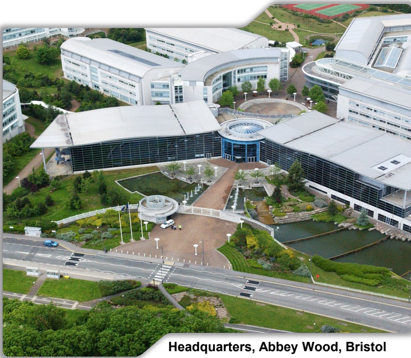
Headquarters, Abbey Wood, Bristol

We're a highly specialised part of the Ministry of Defence. From the procurement of aircraft carriers, food, clothing, tanks to fighter jets, we ensure our UK Armed Forces have the equipment and support they need to carry out their duties effectively.